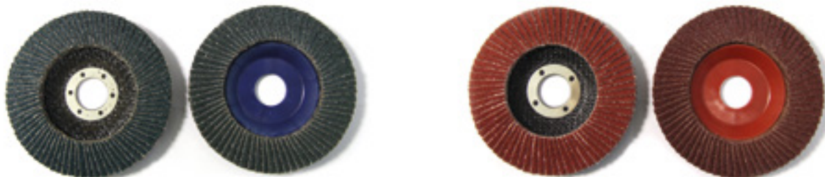
FORMA PIANA - FLAT SHAPE