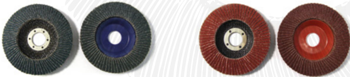
FORMA CONICA - CONICAL SHAPE