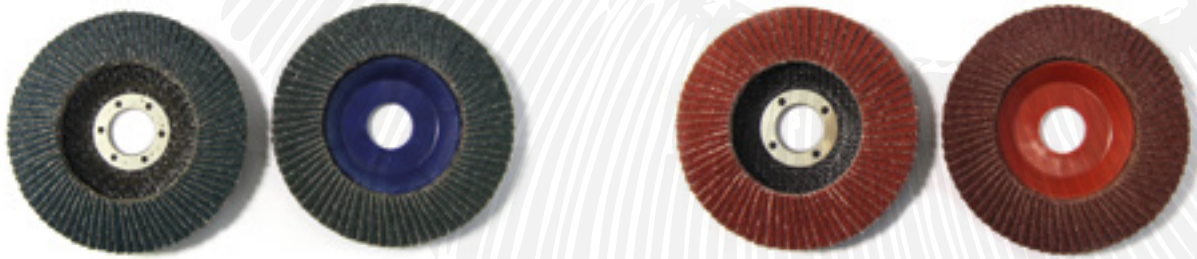
FORMA CONICA - CONICAL SHAPE