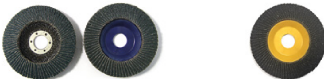
FORMA PIANA - FLAT SHAPE