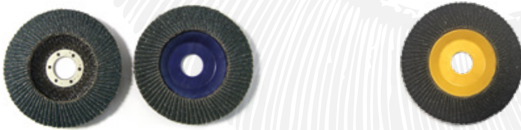
FORMA CONICA - CONICAL SHAPE