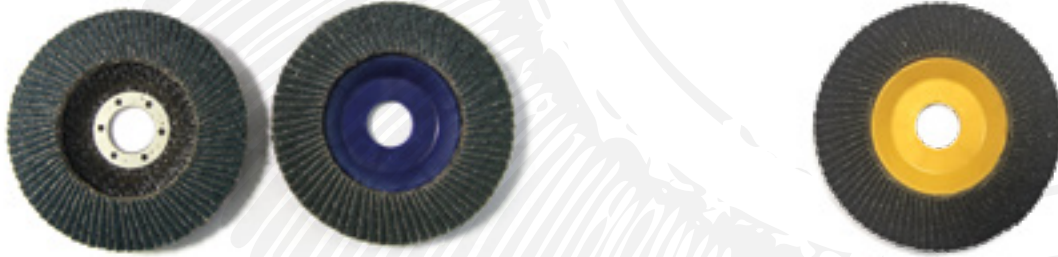
FORMA CONICA - CONICAL SHAPE